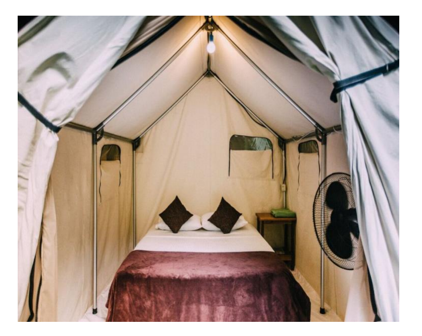
PLATFORM TENT QUEEN BED

Rate per week per person with all meals included:Single occupancy$1,080Double occupancy$795 per person